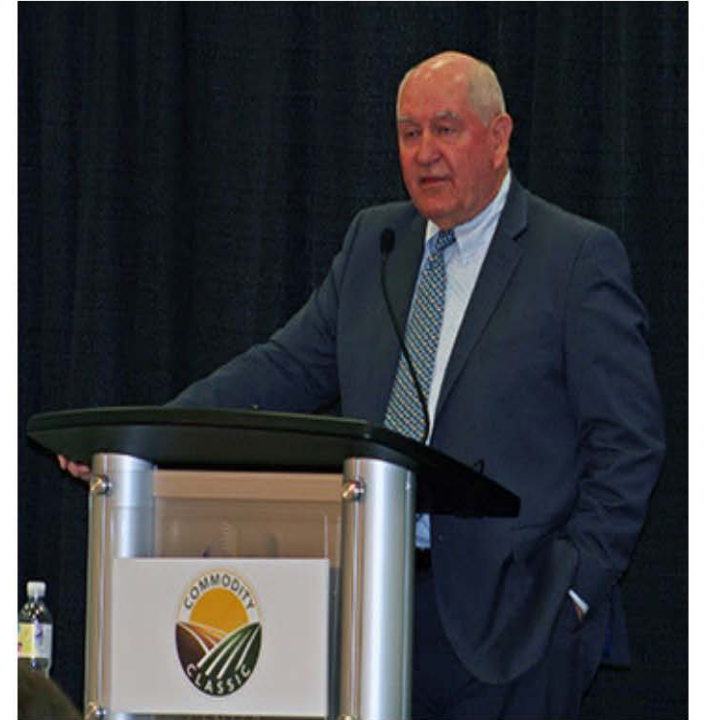
Agriculture Secretary Sonny Perdue answers questions at a news conference following his speech.

USDA has proposed changing the SNAP program so that participants would get half their benefits in food boxes and 50 percent of their benefits through the current system of electronic benefit transfer cards that are reloaded monthly.